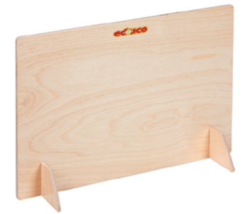
(523210 Space Divider)

Make the game more difficult. Play in pairs. Place a dividing wall (523210) on the table. Take 10 sets (20 cards) and split the sets so that each child gets one card of each set. The first player describes his/her first card to the other child and places it down. The other player must find the matching card and also place it first. Switch roles and repeat the process. Make sure to keep your cards in order! Once you have completed all the sets, remove the dividing wall to see if you were correct!